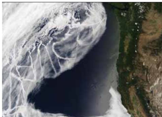
Figure 2. Ship tracks—bright areas of clouds produced by aerosol particles in the exhaust emissions of ships—are an example of albedo modification similar to that produced by deliberate marine cloud brightening. This satellite image shows ship tracks produced by commercial cargo ships off the coast of California.

Albedo modification research is not specifically addressed by any federal laws or regulations beyond those that apply broadly to scientific research and its